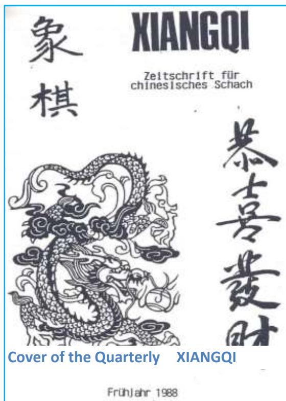
Cover of the Quarterly XIANGQI