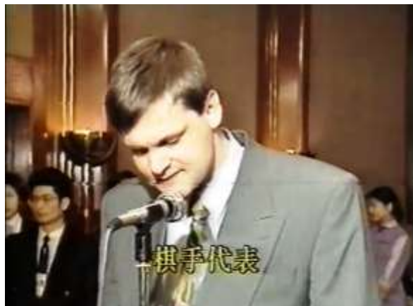
乌韦作为棋手代表在 1993 年北京世锦赛上发言